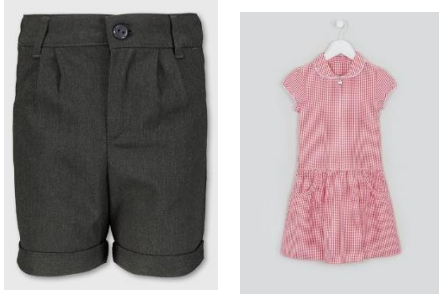
A pair of grey shorts or a red and white checked dress