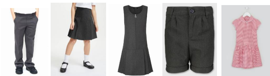
Grey trousers, skirt, dress, or shorts.