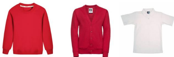
A red sweatshirt or cardigan A white polo shirt

From September we will be taking a stricter stance on children wearing the correct school uniform. Our uniform consists of: